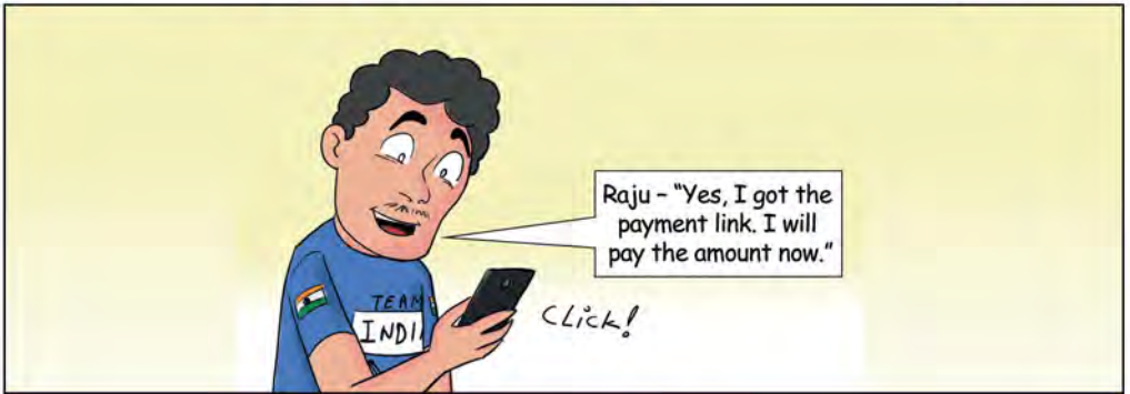
Raju clicked on the link.

Raju received an SMS stating that Rs 40,000 was debited from his account.